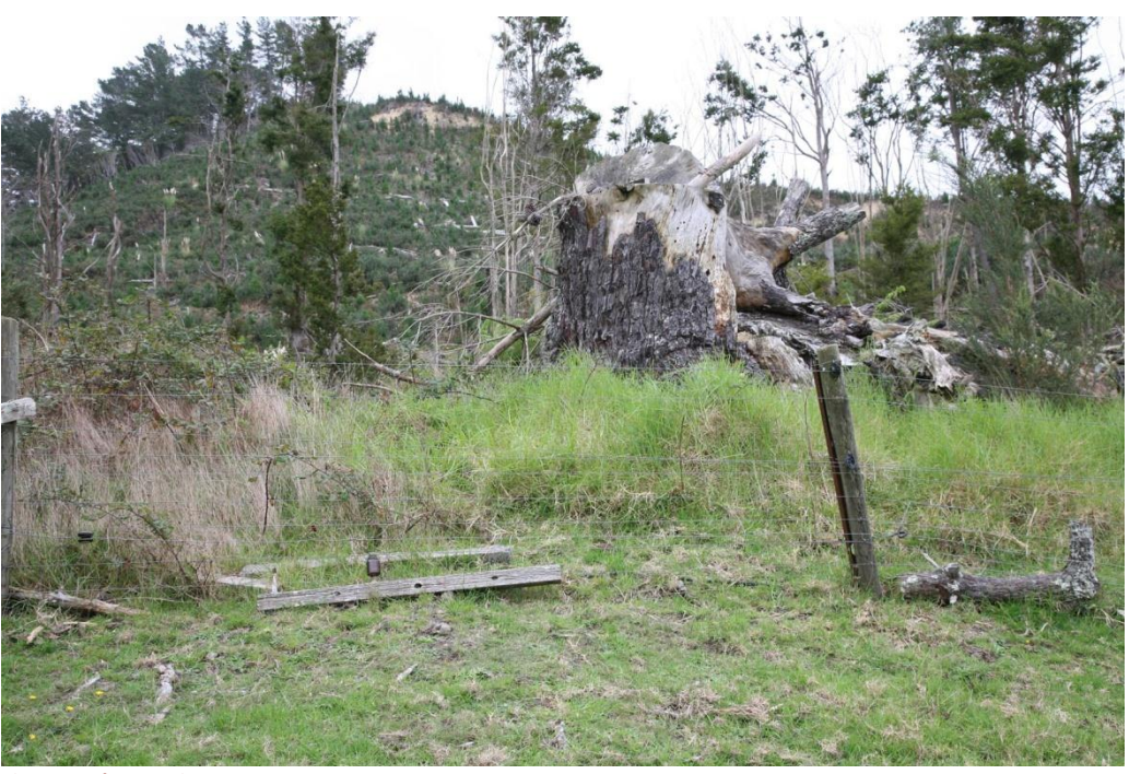
Figure 1: The terrain