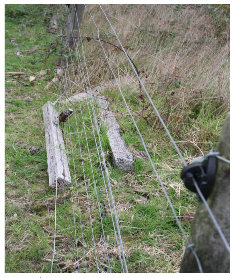
Figure 2: The fence