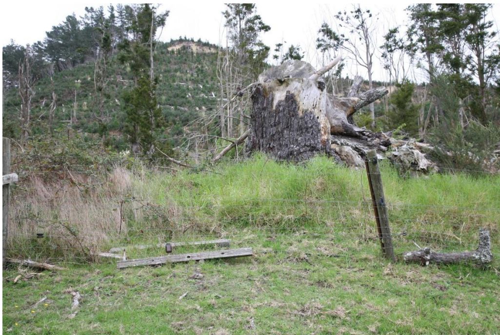
Figure 1: The terrain