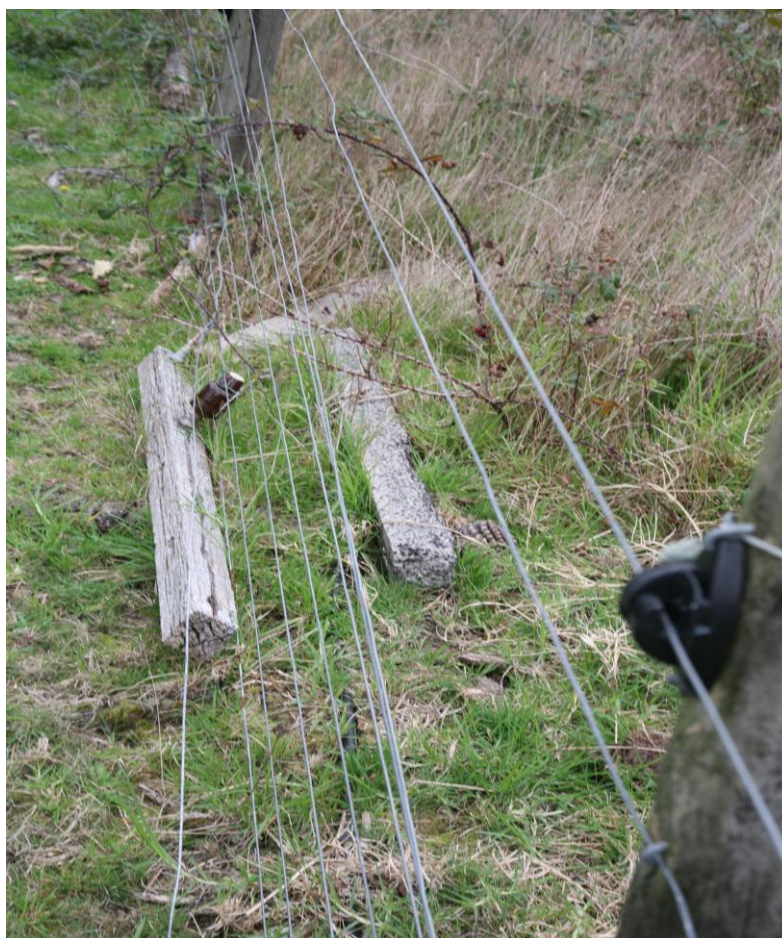
Figure 2: The fence